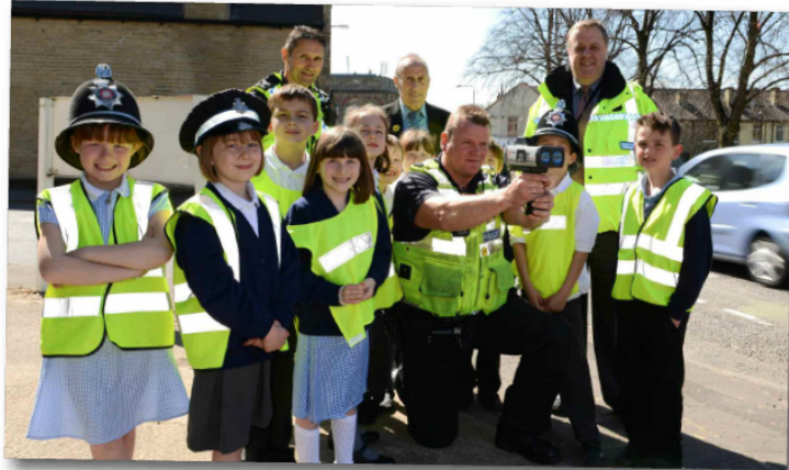
Mark Burns-Williamson conducting speed checks with local school children in Calderdale

When I ask people about the issues that matter to them, road safety and traffic issues are the issues that come up the most 6 . The police and community safety partners have also told me it is an issue. Road safety covers a variety of issues such as inconsiderate parking, speeding, use of mobile phones, general inconsiderate driving, and driving that causes a danger to others and vulnerable road users such as cyclists and pedestrians. While